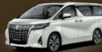
LUXURY WHITE PEARL