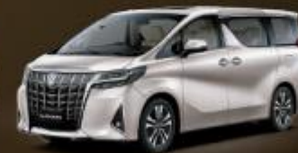
STEEL BLONDE METALLIC*